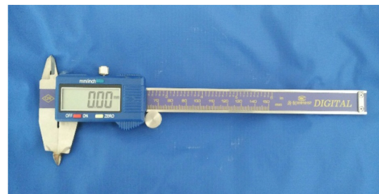
Figure 2. Digital Vernier Caliper

The arch form was then assessed on the cast and recorded according to Testut L. 10 The incisive papilla was identified and then its boundaries were marked by using an HB bonded lead pencil. According to Filho et al. it was evaluated as elliptical (egg-shaped, larger than longer); triangular (triangular-shaped with the vertex directed toward the incisors); or thin (thin and narrow shape) (fig. 1). 11 The anterior, middle and posterior point of incisive papilla were also marked along with the tip of the canine and mesio-incisal edge from the labial side of the maxillary central incisor. A digital Vernier caliper (fig. 2) was used to measure the distance from the posterior point of incisive papilla to the mesio-incisal edge from the labial side of maxillary central incisor (fig. 3). The mean of three readings was recorded to decrease the measuring error. A scale was placed horizontally from tip of one canine to next canine forming the CPC line and its orientation was assessed with relation to the incisive papilla as posterior, middle and anterior to CPC.(fig. 4).