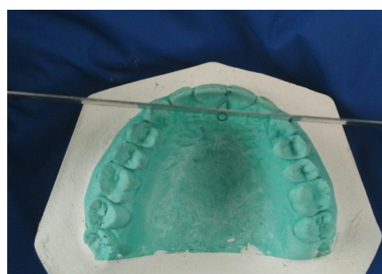
Figure 4. CPC line and its orientation with relation to the incisive papilla

to be normally distributed. One way ANOVA was used to assess the relationship of distance from central incisor to incisive papilla (continuous variable) with various (categorical variable): 1. type of arch forms (parabolic, ellipsoidal and hyperbolic), 2. The shape of incisive papilla (elliptical, thin and triangular) and 3. Type of canine papilla canine relation (anterior, middle and posterior).