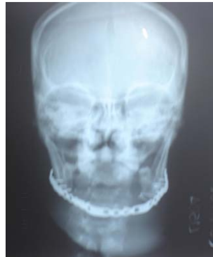
Fig 6: Second Plate applied below rib graft