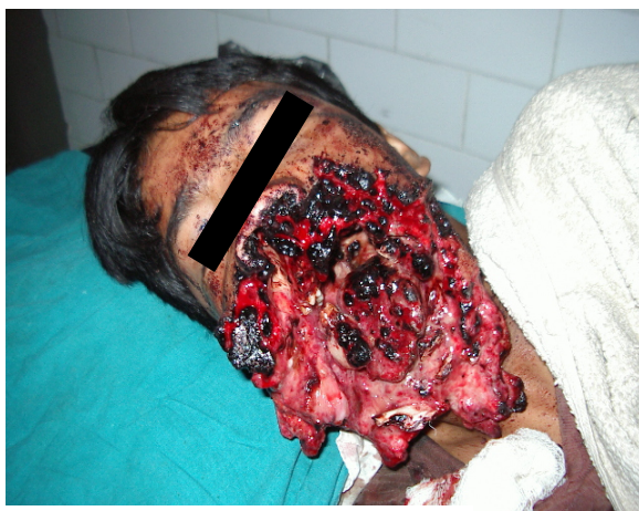
Fig 1: First admission at Bir Hospital

During the six month period (May to November, 2003) he had undergone another four sessions of operation using either GA or local. These were for further remodelling of lips and realignment of the local tissue. At the time of discharge he could swallow soft food.