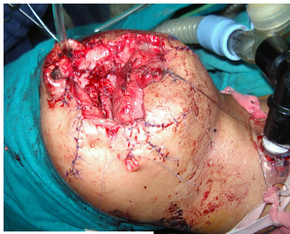
Fig. 2: After first surgery