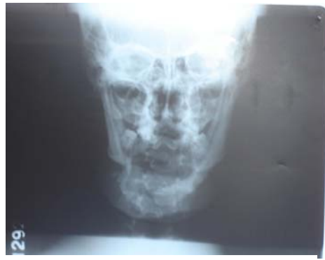
Fig 4: Heterotrophic calcification