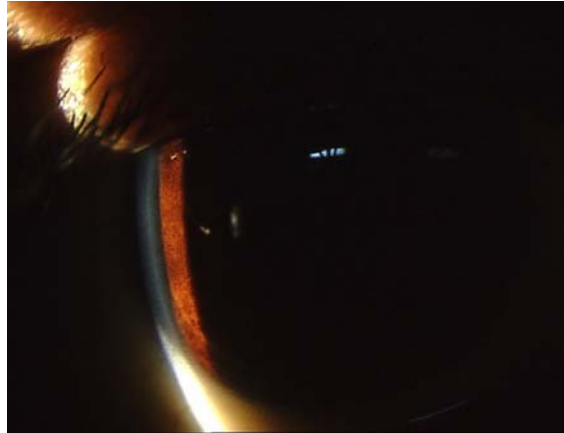
Fig 2: Very shallow anterior chamber at the time of presentation