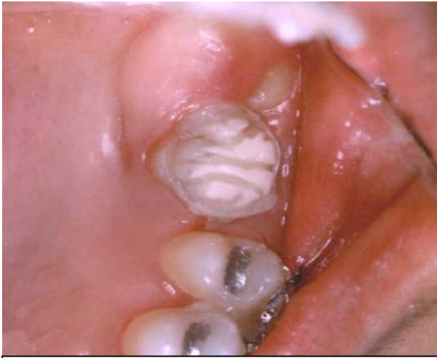
Fig 5: GIC build up on 26