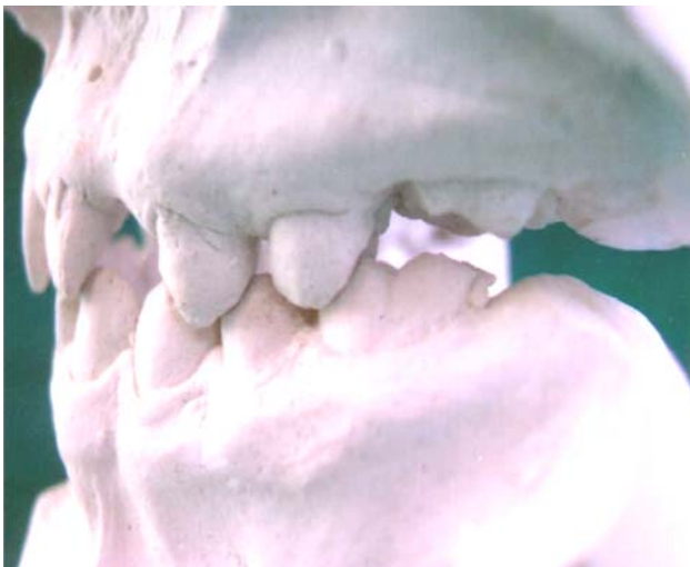
Fig 3: Model view of 26 and 27