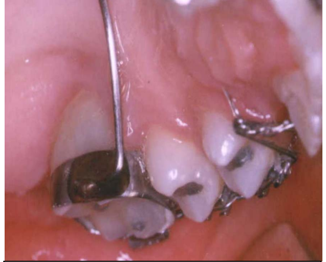
Fig 10: Recemented TPA on 26