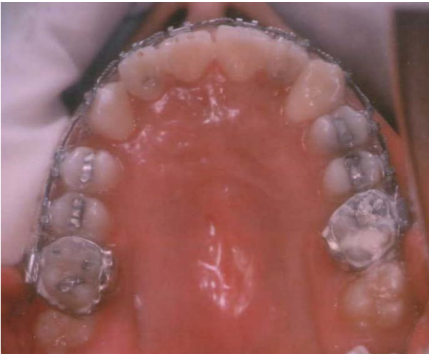
Fig 11: 2 year follow up -Canines erupted and aligned in the arch.