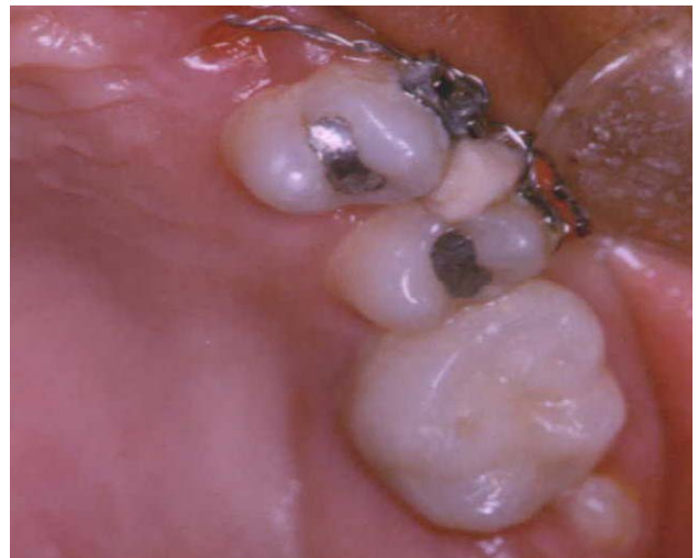
Fig 8: Amalgam cavities in composite crown augmentation.