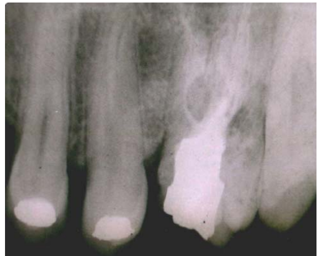
Fig 4: IOPA radiograph of 26