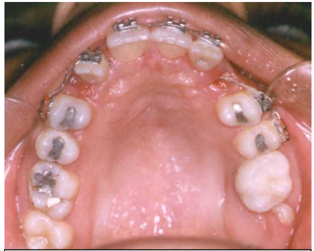
Fig 6: Crown augmentation using composite resin on 26.