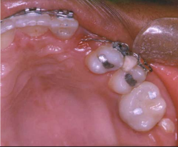
Fig 9: Amalgam occlusal stops.