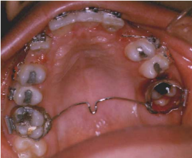
Fig 1: Debonded TPA appliance from 26 & bilaterally impacted maxillary canines.