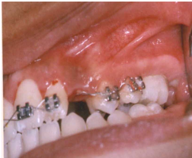
Fig 7: Buccal view of crown augmented 26.