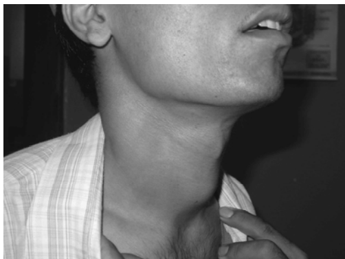
Fig 1: Tuberculous goitre in a 26 year old male