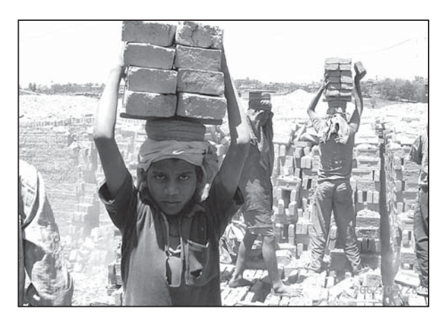
Fig 5: A child worker carrying bricks.