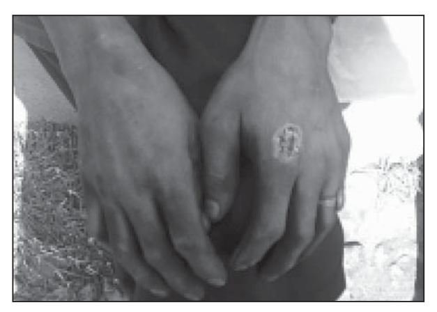
Fig 3: Chemical burn