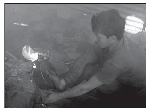
Fig 1: Metal casting work without protection.