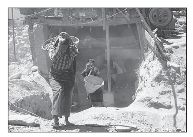
Fig 4: Stone crusher plant.