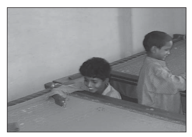
Fig 6: Child workers doing embroidery work