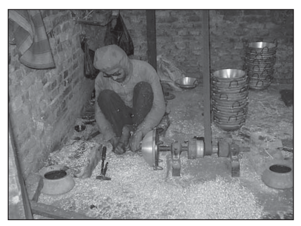
Fig 2: Grinding and polishing of metal.