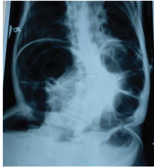
Fig 2: Dilated loops of large intestine with air fluid level due to sigmoid volvulus showing as gas under the diaphragm with scoliosis.