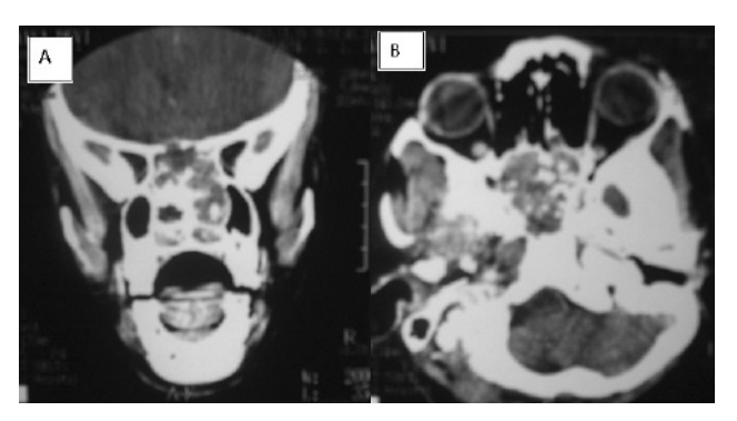
Figure 1. CT scan of PNS showing midline destructive mass with specks of calcific foci, occupying the nasal septum, both nasal cavities, ethmoid (A) and sphenoid sinus (B).

lobules of chondroid tissue with mildly increased cellularity. Chondrocytes with hyperchromatic nuclei with prominent nucleoli in some binucleated cells were also seen with focal invasion into bone tissue and it was consistent with chondrosarcoma grade 1 (Fig 2). The patient then received external beam radiotherapy i.e 60G 30 fractions over six weeks period after consultation with a medical oncologist. Four months following her treatment she had no recurrence.(Fig 3)