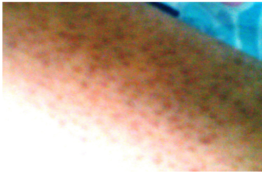
Figure 1. Purpuric Rash Over the Lower Leg Observed in Case 1.