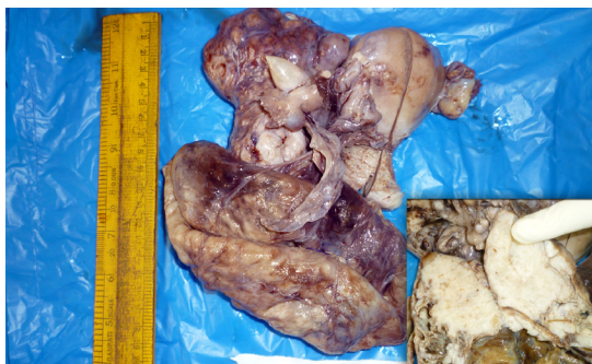
Figure 2. Resected specimen showing a hemorrhagic bosselated broad ligament mass with uterus and bilateral ovaries grossly uninvolved. Inset showing cut section of the mass which is greyish white solid with cystic areas.

(figure 1), possibly adenocarcinoma could not be ruled out. Staging laparotomy with total abdominal hysterectomy and bilateral salpingo-oophorectomy was done which revealed a huge haemorrhagic tumor in right broad ligament. Grossly uterus and bilateral ovaries were normal. An ovoid mass arising from right broad ligament with hemorrhagic, variegated and bosselated appearance measuring 19 cm x 10 cm x 3.5 cm was noted. Cut section showed solid greyish white areas along with hemorrhagic cystic areas (Figure 2).