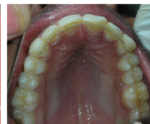
Figure 5. Post-treatment labial view of the dentition Figure 6. Post-treatment occlusal view of maxillary arch

pits which were confined to the crowns of the teeth. These invaginations were of the enamel-lined minor form, within the confines of the crown and not extending beyond the cemento-enamel junction, which was consistent with the diagnosis of a dens invaginatus type I (Oehlers classification). 11 The radiograph also showed the mesiodens as having a straight, tapered root. Intraoral periapical radiographs of the maxillary canines exposed the talon cusps as typical inverted cones with enamel and dentine layers and pulp horns extending only into the base of the cusps. The patient was clinically asymptomatic and none of these anomalies was associated with caries, gingivitis or loss of vitality.