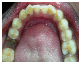
Figure 1. Intraoral occlusal view of the maxillary arch showing a- mesiodens, b- dens invaginatus in shovel-shaped central incisors, c- dens invaginatus in lateral incisors and d- talon cusps on canines

anteriorly proclined. The permanent maxillary right central incisor was deflected more labially in the arch (overjet = 10 mm) than its counterpart on the left side (overjet = 6 mm) due to the presence of an erupted, conical mesiodens (Fig.3).