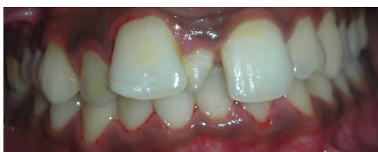
Figure 3. Labial view of the dentition

anteriorly proclined. The permanent maxillary right central incisor was deflected more labially in the arch (overjet = 10 mm) than its counterpart on the left side (overjet = 6 mm) due to the presence of an erupted, conical mesiodens (Fig.3).