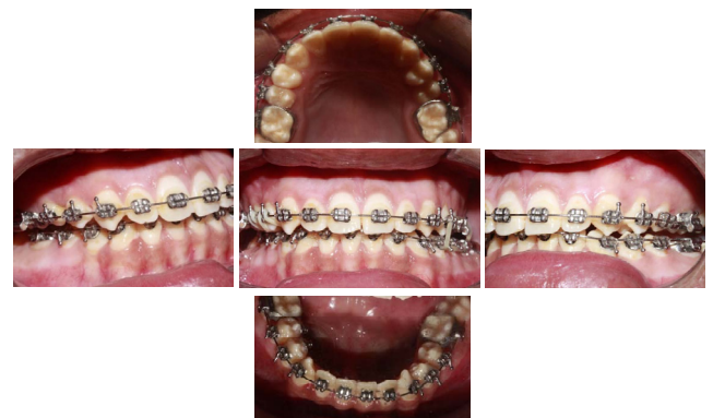
Figure 5. Post-surgical orthodontics.