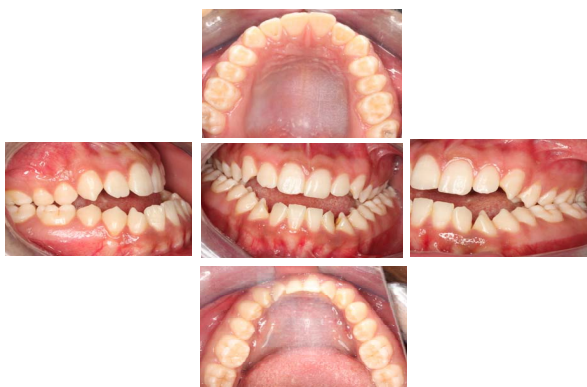
Figure 2. Pre treatment intra oral photograph.