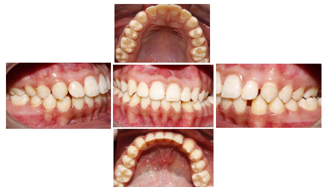
Figure 6. Post treatment intra oral.