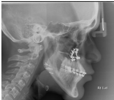
Figure 8. Post treatment lateral cephalograph.