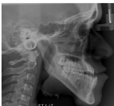
Figure 3. Pre-treatment lateral cephalograph.

So the case was diagnosed to be Skeletal Class III Malocclusion with Mandibular Prognathism, maxillary retrognathism with reverse overjet and posterior cross bite with midline shift. The treatment plan was Orthognathic Surgery which consisted of : Pre-surgical orthodontics, Surgery to reposition the aberrant jaws, post surgical orthodontics followed by retention. The presurgical orthodontics involved banding and bonding with mechanics mainly involved to decompensate the naturally compensated dentition, aligning and levelling (Fig. 4). This phase took almost nine months because of the moderate crowding and posterior cross bite. The surgical procedure consisted of double jaw surgery involving maxillary advancement with le fort I osteotomy and mandibular setback with Bilateral Sagittal Split Osteotomy (BSSO). The patient was admitted in hospital and discharged on 5 th Post-operation day with class II, ¼" guiding elastics. The post surgical orthodontic included detailing and finishing of the occlusion and minor corrections (Fig. 5). This phase consisted of six months. Retention phase was started after removal of the bands and brackets. The patient is still in retention phase. The post treatment result shows pleasant facial profile, reduced facial height and coincident midline and Class I molar and canine relation (Fig. 6,7,8). 3 years follow up has shown stable treatment result with very minimal relapse tendency.