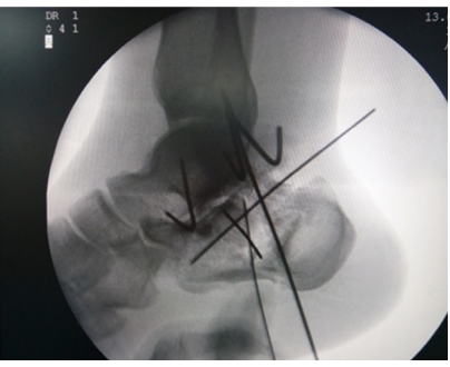
Figure 1e Reduction is verified radiologically under C arm