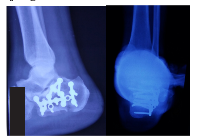
Figure 3. Post operative X-rays at 2 year follow up