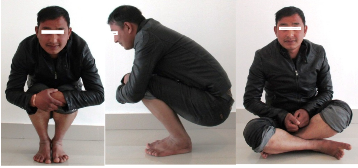
Figure 2. Clinical outcome at 2 year follow up (squatting and crossed leg sitting)

Twenty-two cases of calcaneal fractures managed with ORIF and LBCP were available for final evaluation. Clinical outcome, as measured using the Maryland foot score, showed majority of the patients had a good outcome. (Figure 2) (Table 1) Radiological assessment comparing preoperative to post-operative improvement in Boehler's and Critical angle of Gissane showed significant improvement after ORIF with LBCP. (Figure 3) (Table 2)