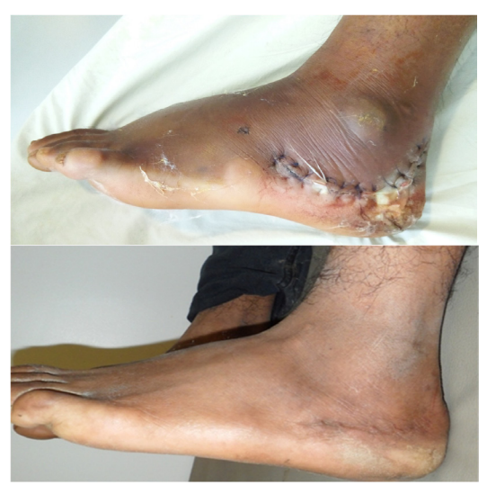
Figure 5. Post operative superficial wound infection, After the wound is healed, 2 year follow up.