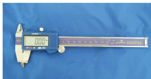
Figure 2. Digital Vernier Caliper

The arch form was then assessed on the cast and recorded according to Testut L. 10 The incisive papilla was identified and then its boundaries were marked by using an HB bonded lead pencil. According to Filho et al. it was evaluated as elliptical (egg-shaped, larger than longer); triangular (triangular-shaped with the vertex directed toward the incisors); or thin (thin and narrow shape) (fig. 1). 11 The anterior, middle and posterior point of incisive papilla were also marked along with the tip of the canine and mesio-incisal edge from the labial side of the maxillary central incisor. A digital Vernier caliper (fig. 2) was used to measure the distance from the posterior point of incisive papilla to the mesio-incisal edge from the labial side of maxillary central incisor (fig. 3). The mean of three readings was recorded to decrease the measuring error. A scale was placed horizontally from tip of one canine to next canine forming the CPC line and its orientation was assessed with relation to the incisive papilla as posterior, middle and anterior to CPC.(fig. 4).