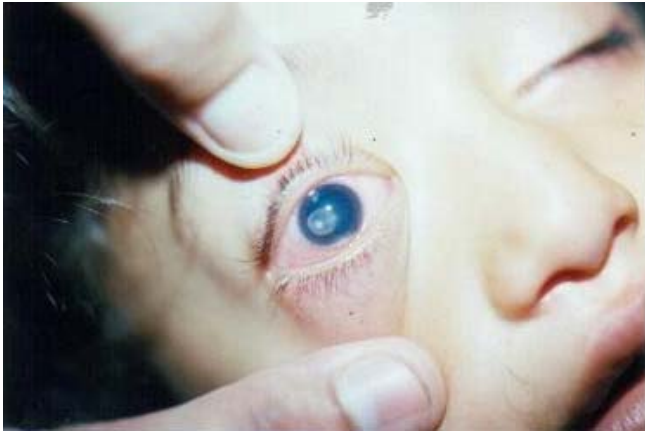
Fig 1: Cysticercosis in anterior chamber of eye