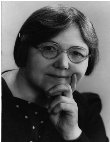
Mary Broadfoot Walker

Mary Broadfoot Walker (1896-1974) introduced the use of physostigmine in myasthenia gravis. Recorded in 1934, as myasthenia gravis had symptoms like curare poisoning, the curare antidote physostigmine might help it so she injected some into her very droopy patients. Then, with utter surprise, like Lazarus rising from the grave, they rose and walked across the room. Dr. Mary Walker had made one of those great medical discoveries of a “specific” medicine for a specific disease, like a key turning on the lock.