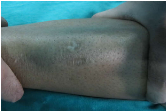
Figure 1. Clinical Picture of Swelling Over the Left Leg.