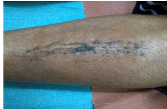
Figure 4. Clinical Picture at 2 Months Follow-Up.