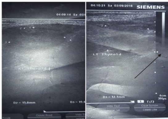
Figure 1. Showing right and left lobe of thyroid gland with absent isthmus.

about isthmus in ultrasonographic report. Fine-needle aspiration cytology was performed which was suggestive of Papillary carcinoma of right lobe of thyroid. Thyroid function test and other preoperative blood parameters were within normal limit. For the treatment, the patient underwent total thyroidectomy. During surgery, isthmus was absent, right and left lobes of thyroid gland were completely separated due to isthmus agenesis. (Fig. 2) Right lobe of thyroid measured 5x3x2 cm. External surface was brownish in colour with firm consistency. Left thyroid lobe measured 4.5x3x1.5 cm. External surface was smooth and brownish in colour. Histopathological report of the specimen was consistent with well differentiated Papillary Carcinoma of right lobe of Thyroid gland and lymphocytic thyroiditis of left lobe of thyroid. His post-operative period was uneventful. Patient was discharged on seventh post operative day and he is under regular follow up.