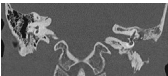
Figure 1. Coronal HRCT image of temporal bone showing soft tissue opacification at the left external auditory canal extending into tympanic cavity with erosion of inferior wall of external auditory canal, scutum and left incus.