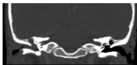
Figure 4. Soft tissue opacification within right tympanic cavity ossicular erosion and breach of tegmen plate.

Table 2 shows the comparison between high resolution temporal bone CT findings and intra operative findings along with sensitivity, specificity, positive predictive value and negative predictive value for the different CT findings.