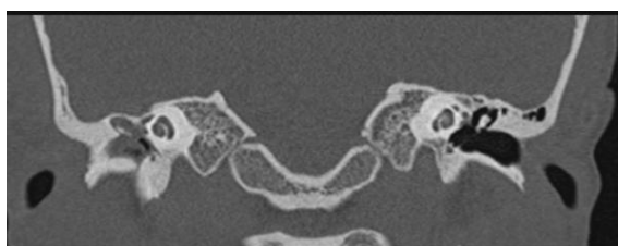
Figure 3. Coronal HRCT image showing soft tissue opacification at right tympanic cavity with erosion of right incus and right facial canal.