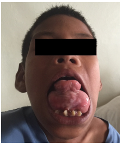
Figure 1. Cystic mass in the floor of the mouth resulting in elevation of tongue.