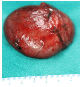
Figure 2. Excised cystic mass