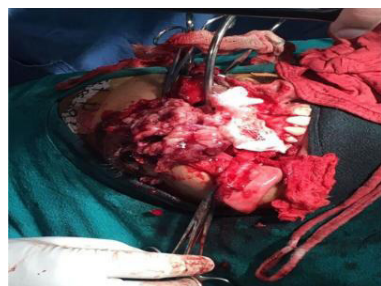
Figure 2. Tumor seen during surgery