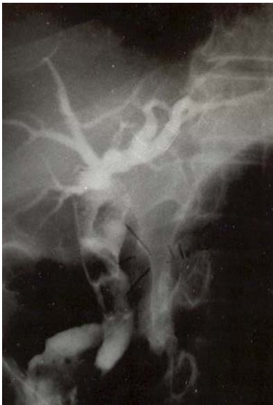
Figure 3 ERCP showing dilated CBD with multiple calculi