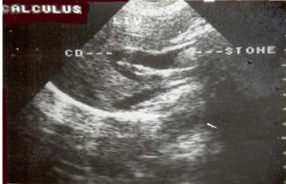
Figure 1 USG showing dilated CBD with calculus