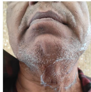
Figure 4. Post Operative photograph after excision the lipoma of left parotid gland.

encapsulated tissue comprising of sheets of lobules of adipocytes. individual cells had eccentrically pushed nuclei and abundant vacuolated cytoplasm. Few blood vessels and area of hemorrhage. No atypia were seen and features were consistent with that of a lipoma. A final diagnosis of parotid gland lipoma was obtained based on the preceding microscopic characteristics.