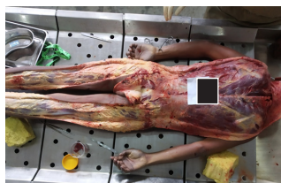
Figure 7. Intradermal contusions present on posterior aspect of left leg and thigh