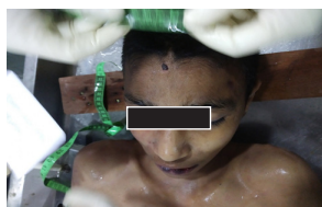
Figure 1. Abrasion with dark brown scab on forehead and contusion on both lips.