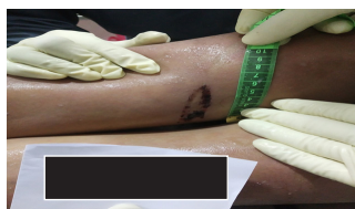
Figure 2. Patterned abrasion present on medial aspect of left thigh.