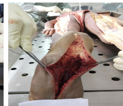
Figure 9. Intradermal contusion present on left sole.

posterior aspect of left leg and thigh (fig. 7), right sole (fig. 8) and left sole (fig. 9). Routine viscera for chemical analysis and a piece of white cloth soaked in deceased's blood were sealed, labeled and handed over to the investigating authority. Pieces of bilateral kidneys were sent for histopathological examination. Chemical analysis report of viscera is yet to be available till the date of reporting the case whereas histopathological examination of pieces of bilateral kidneys showed features of tubular necrosis.