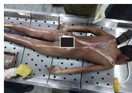
Figure 3. Demonstration of multiple abrasions and contusions on posterior body surface with X-incision.