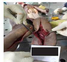
Figure 8. Intradermal contusions present on right sole.