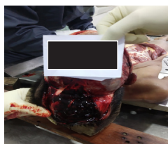
Figure 5. Subscalpal haematoma on occipital region.