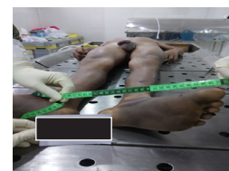
Figure 4. Contusions present on bilateral soles, front of left leg and abrasion on left leg.