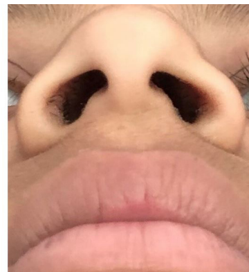
Figure 3. Teardrop shape of nostril