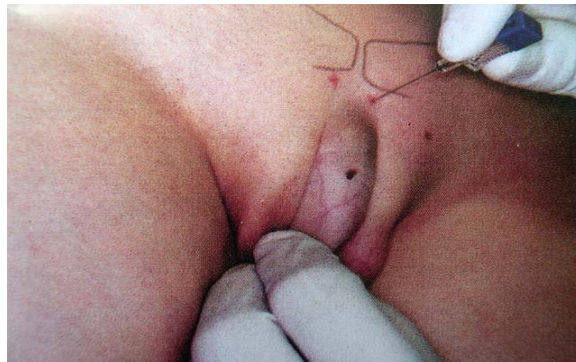
Fig. 1. Para median approach for penile block.

The postoperative analgesia in this study was found to be from 8 -76 hrs in total number of cases. The mean postoperative analgesia duration was 18.915 \pm 1.582 hrs.